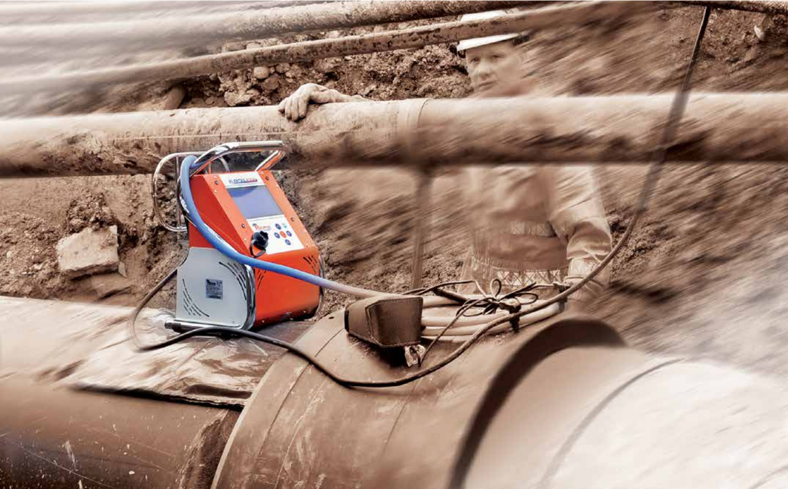
* WORKING RANGE Ø mm