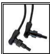
90° Universal connectors 4.0-4.7mm