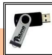
Software Ritmo Transfer